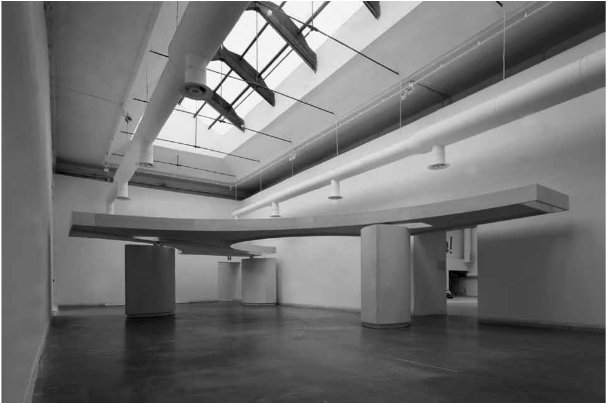
1. Gabriel Orozco, Shade Between Rings of Air , 2003, birchwood and metal, 280 × 800 × 1400 cm (9 feet 2¼ in. × 26 feet 2 15/16 in. × 45 feet 11 3/16 in.). Installation view at the 50th International Art Exhibition, Dreams and Conflicts – The Dictatorship of the Viewer , Venice Biennale, 2003

construction and his own sculpture, Orozco notes that what interested him in making the replica was