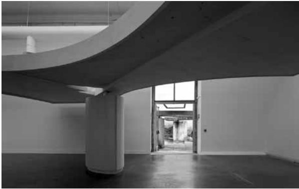
4. Gabriel Orozco, Shade Between Rings of Air, and partial view of Carlo Scarpa's Pensilina made for the 2 nd Venice Biennale (1952), 2003

as a loft which was connected to the main hall by stairways. 22 The Ambiente installation was situated below the loft, right at the centre of the Italian Pavilion in the midst of the exhibition. Ambiente thus served as a place of transition between the different exhibition sections, while also designating an interdisciplinary space between architecture and sculpture. In Ambiente , Scarpa developed some of the ideas he had initially explored in his sculpture garden where the distinctly sculptural Pensilina was situated. In the