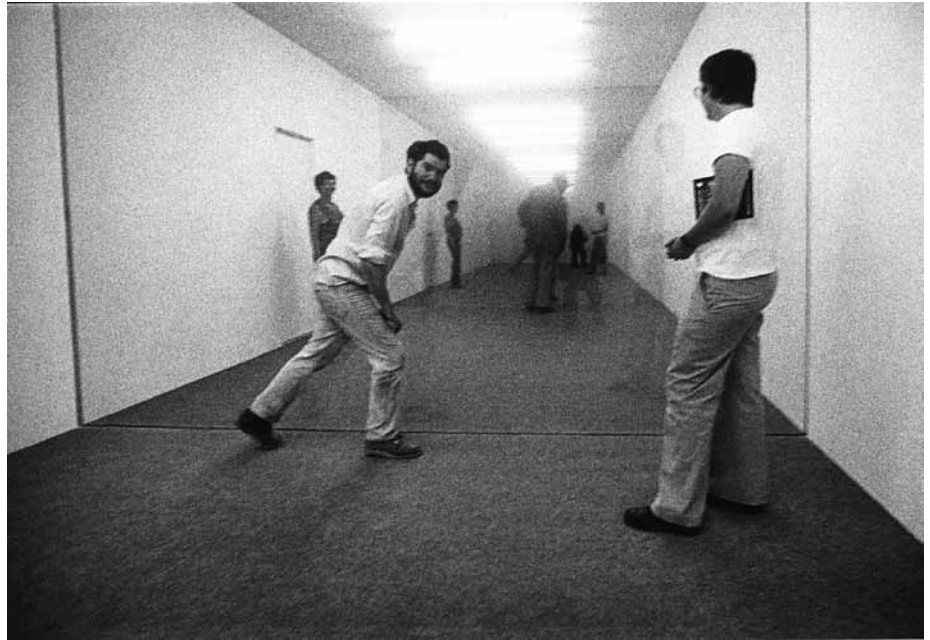
10. Dan Graham, Public Space/ Two Audiences, 1976. Installation view at Ambiente Arte, 37th Venice Biennale

moment, 'here-and-now', Graham was investigating new theories of viewing involving the body of the spectator and overlapping timeframes, with emphasis on the 'just past' experience, the recent past, thus highlighting and heightening transience and the experience of time passing .