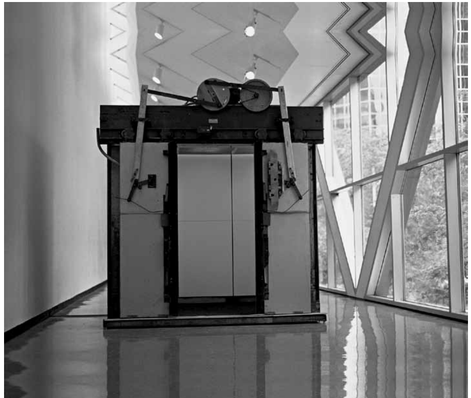
6. Gabriel Orozco, Elevator , 1994, modified elevator cabin, 243.8 x 243.8 x 152.4 cm (8 feet x 8 feet x 5 feet)