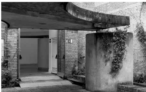
3. The door between the inner courtyard and the gallery space of the Italian Pavilion, with partial view of Gabriel Orozco, Shade Between Rings of Air, and partial view of Carlo Scarpa's Pensilina made for the 26th Venice Biennale (1952), 2003

Air has been presented at the Palacio de Cristal in Madrid, as well as at the Marian Goodman gallery in Paris (figs. 8, 9). The art curator Jessica Morgan observes that despite the work's site-specific point of departure in Venice, the 'vast, luminous space' of the Palacio de Cristal provided an ideal situation for the work, 'its elegant white curvilinear ceiling creating a respite from the otherwise exposed space of the glass and steel structure'. 19 Moreover, removed as it was from the original Scarpa building and 'as a sculpture dwarfed in a much