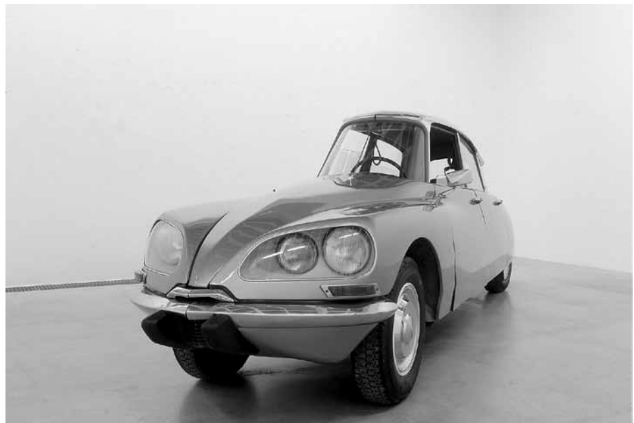
5. Gabriel Orozco, La DS , 1993, modified Citroën DS, 140.1 × 482.5 × 115.1 cm (55 3/16 in. × 15 feet 9 15/16 in. × 45 5/16 in.)

Whether Mies considered the sculpture to be modern, albeit in a different way to the pavilion, or saw it as a contrast to his modern architecture is open to debate. Certainly, Kolbe's Morning is contemporaneous with Mies's architecture; however, the work's contemporaneity does not necessarily make it a modern sculpture. 27 The sculpture represents a female nude standing on a plinth with knees slightly bent and arms extending upwards, slowly unfolding over her head. In an elegant circular movement, almost like a dancer's, her left palm is turned towards the face, while the right palm is stretching up towards the sun as if she were slowly waking up to the new day. The head is looking downwards and diagonally to the left, engaging the whole body in a slightly spiral movement. Mies placed the sculpture on a plinth in the outdoor pool, as if it were emerging from the water. The figure's gaze falls towards the glistening still water surface, as if looking at her own reflection. Curtis brings attention to the centrifugal movement of the figure, as 'it opens outwards, rippling, in a manner suggestive of the pool where it stands, and the building around it'; in this way the sculpture's formal characteristics make it responsive to its distinctly modernist architectural surroundings. 28